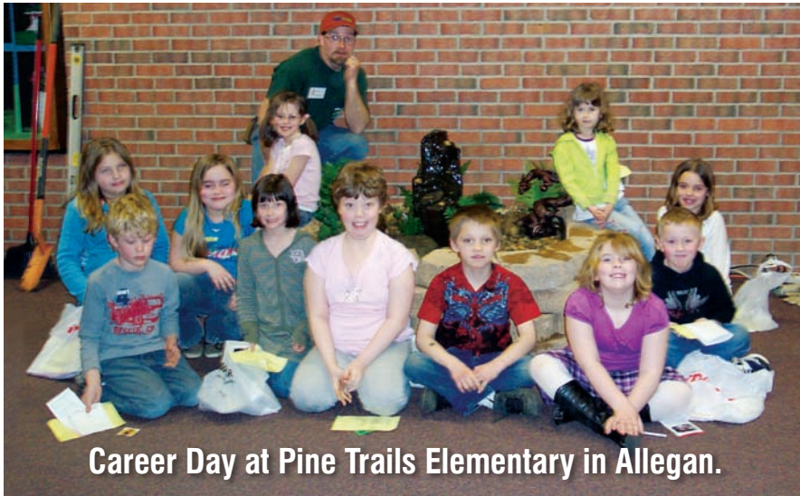
Career Day at Pine Trails Elementary in Allegan.